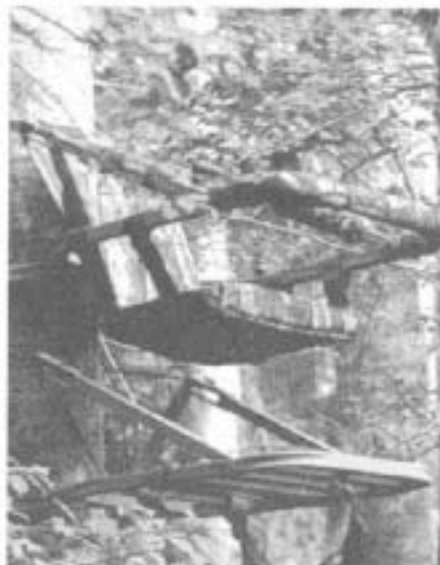
Summit - Goliath