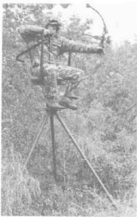
South Texas Tripods Inc. - 10' Tripod

10' Tripod: For hunters who don't always have trees in the right spot, the tripod from South Texas Tripods Inc. offers solutions. In less than 30 seconds, a hunter can take down the stand, load it onto his shoulder, and quietly move to a better spot. This stand features a sturdy shooting rail, but it is easily removed for bowhunting.